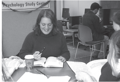
Undergraduate Study Center

Over the past year, a great deal of progress was made in creating a welcoming space for our psychology majors. The Center is now used for individual study, TA office hours, review and study sessions, Psi Chi meetings, and more casual events, such as "pizza lunch with the Chair."